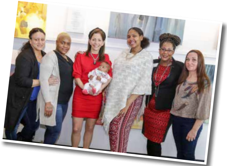
▲ First Lady of New Jersey Tammy Murphy pictured with some of the clients and staff of the For My Baby and Me program at HomeFront’s Family Campus in Ewing

She’s now studying to become a home health aide.