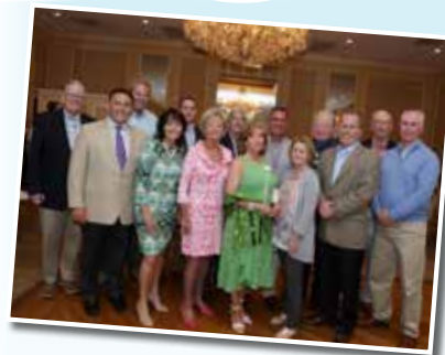
▲ Members of the Monmouth County Board

The Monmouth County Board's Annual Cheers to Summer event was held at the Spring Lake Bath & Tennis Club on May 25th. The event raised more than $64,000 to benefit programs in Monmouth County. The event featured dinner, cocktails, dancing, a gift auction and 50/50 raffle. A.H. Fisher Diamonds donated a beautiful bracelet valued at more than $600. We wish to acknowledge the following sponsors who made this successful event possible and have been critical in supporting our services in Monmouth County: